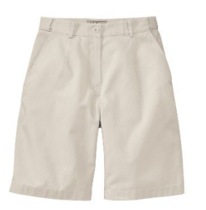
Girls: Appropriate Dress Shorts