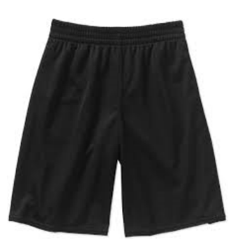
Athletic Shorts for PE Only