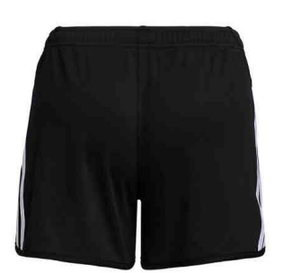
Athletic Shorts for PE Only