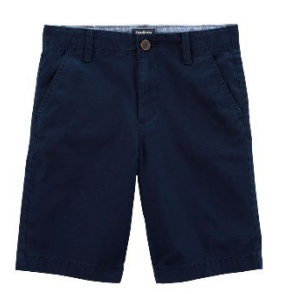
Boys: Appropriate Dress Shorts